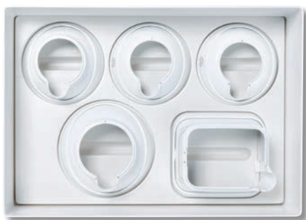
179102 Box ERGO-Base with all 5 fixed-focus holders

Items can be ordered with or without the necessary batteries as per price list.