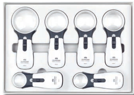
Box 2 ERGO-Lux MP mobil

Contents: 12 D Ø 35 mm, 10 D 75x50 mm right-handed, 8 D Ø 85 mm, 8 D 100x75 mm right-handed, 6 D Ø 100 mm