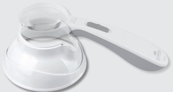
177102 ERGO-Base for ERGO-Lux MP 12 D