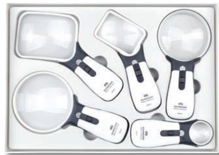
Box 1 ERGO-Lux MP mobil