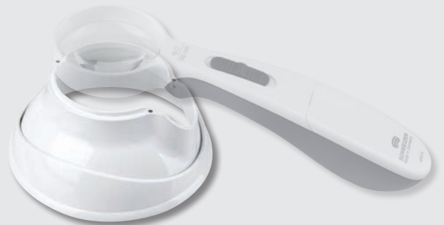
176102 ERGO-Base for ERGO-Lux MP 16 D