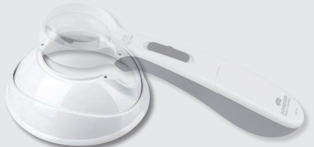
175102 ERGO-Base for ERGO-Lux MP 20 D