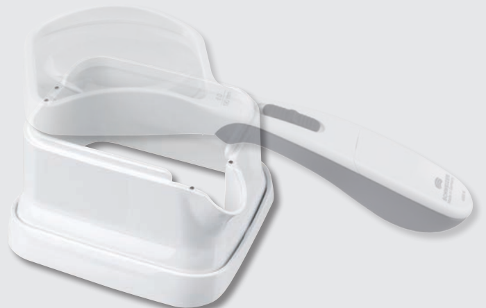
178102 ERGO-Base for ERGO-Lux MP 8 D