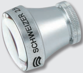
937255 2.5x Field of view 18°; 20 g