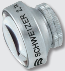
937215 2.1x Field of view 20°; 18 g