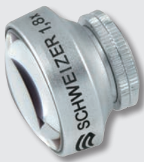
937185 1.8x Field of view 23°; 13 g