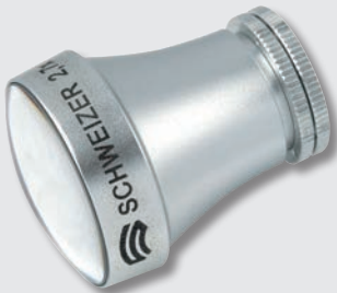
937275 2.7x Field of view 13°; 30 g