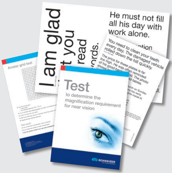
938157-EN Near vision reading test set

each panel divided into upper and lower half