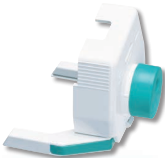
183102 MODULAR TS basic unit