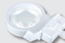
192102 Head MODULAR 16 D / Ø 60 mm