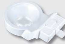
190102 Head MODULAR 28 D / Ø 35 mm

Easily interchangeable battery operated basic unit (handle with fixed tilting part). Tilting part can be swivelled for right or left-handed use