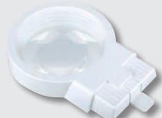
193102 Head MODULAR 12 D / Ø 70 mm