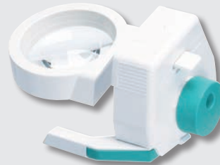
183502 MODULAR TS