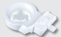
191102 Head MODULAR 20 D / Ø 55 mm