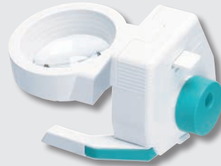
183402 MODULAR TS