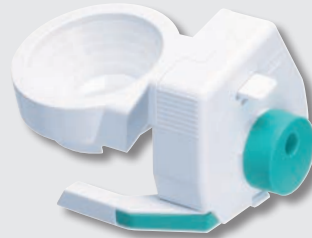
183302 MODULAR TS