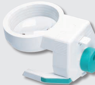
183602 MODULAR TS