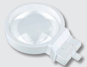
195102 Head MODULAR 6 D / Ø 100 mm

Items can be ordered with or without the necessary batteries as per price list.