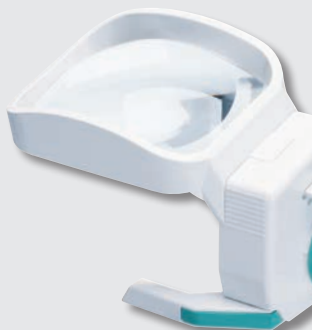
183802 MODULAR TS