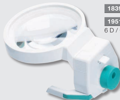
183902 MODULAR TS