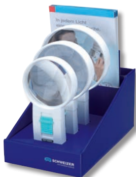
Carton display 3 ÖKOLUX plus mobil

Contents: 12 D Ø 70 mm, 10 D 75x50 mm straight, 10 D 75x50 mm right-handed, 8 D Ø 85 mm, 6 D Ø 100 mm, base, 20 consumer flyers