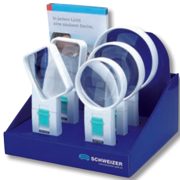
Carton display 5 ÖKOLUX plus mobil