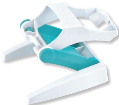
130092 ÖKOLUX plus mobil base

Contents: 12 D Ø 70 mm, 8 D Ø 85 mm, 6 D Ø 100 mm, base, 20 consumer flyers