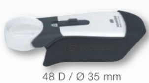
48 D / Ø 35 mm