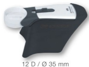
12 D / Ø 35 mm