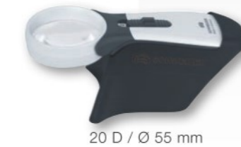
20 D / Ø 55 mm