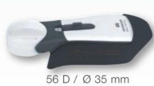
56 D / Ø 35 mm