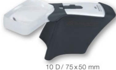
10 D / 75x50 mm