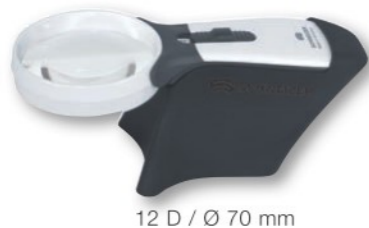
12 D / Ø 70 mm