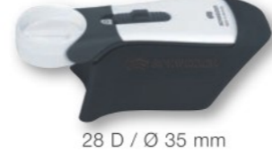
28 D / Ø 35 mm