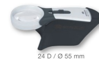
24 D / Ø 55 mm