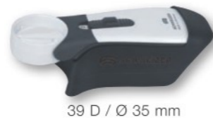
39 D / Ø 35 mm