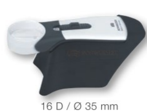
16 D / Ø 35 mm