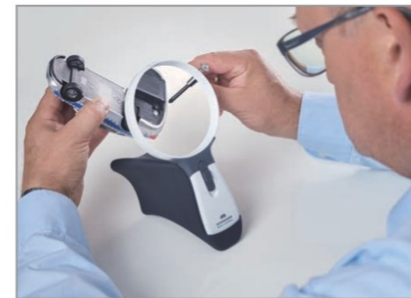
ERGO mobil Base up to 24 D can also be used in an upright position, leaving both hands completely free for close-up work