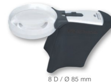
8 D / Ø 85 mm