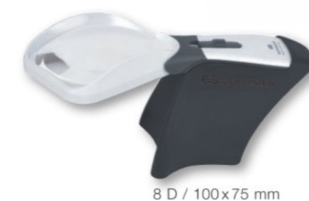
8 D / 100x75 mm