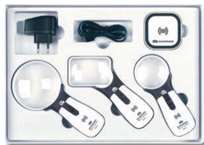
Box ERGO-Lux i mobil with 2 pads and USB adapters