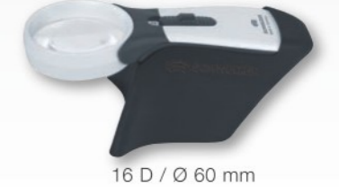
16 D / Ø 60 mm