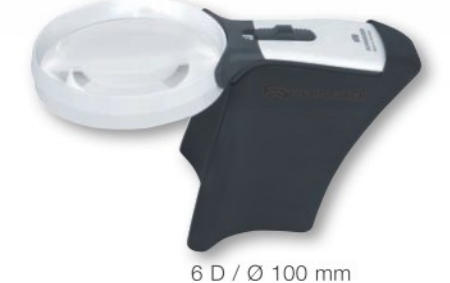
6 D / Ø 100 mm