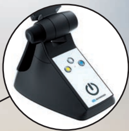
Table lamp with rechargeable battery and 3 light temperatures

Lamp pole height: approx. 96 cm; base Ø: approx. 28 cm Arm segment length (hinge-to-hinge): approx. 30 cm Weight: approx. 3.8 kg; power cord: 150 cm