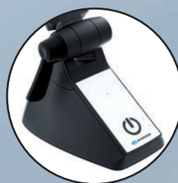
Table lamp with rechargeable battery in one individual light temperature of choice